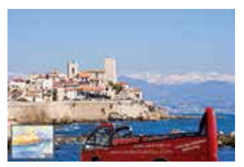
DISCOVERY OF THE CITY Guided tours & museums

42, avenue Robert Soleau 06600 Antibes Tel.: +33 (0)4.22.10.60.10